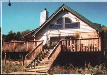
Right Gable Elevation